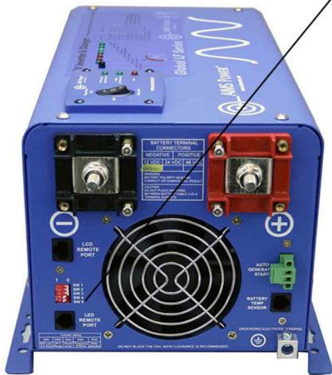
AIMS Inverter Charger 12Vdc